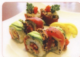
New Orleans Maki - $10.95 cajun seasoned crawfish roll topped with pepper crusted tuna and avocado served with cajun sauce (8 pc)