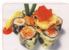
Hot Geisha Maki - $8.95 smoked salmon tempura roll topped with spicy green shell mussel then baked with a special sauce (6 pc)