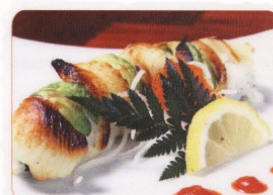
Miso Seabass Maki - $10.95 crab, asparagus and avocado roll topped with broiled miso seabass (8 pc)