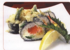
Sumo Maki - $10.95 shrimp tempura, cream cheese, salmon, avocado, cucumber and jalapeno rolled then tempura fried (6 pc)