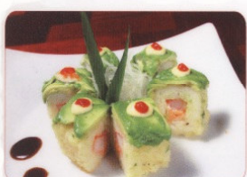
S & M Maki - $9.95 spicy salmon and kani tempura rolled with avocado topped with a sweet soy glaze (8 pc)