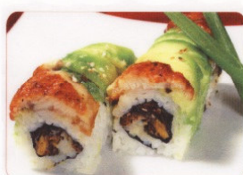
Sky Diver Maki - $14.95 soft shell crab roll topped with avocado and unagi with a special sauce (8 pc)