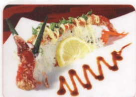
Pokemon - $13.45 crab, smoked salmon, soft shell crawfish topped with spicy caviar sauce (6 pc)