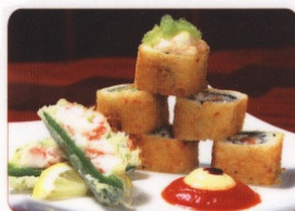
Memphis Maki - $11.95 grilled shrimp, jalapeno, onion, wasabiko with yellowtail coated in ginger-garlic bread crumbs and topped with spicy scallops (8 pc)