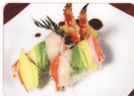
Emperor Maki - $18.95 sweet alaskan king crab and escolor rolled with mango, avocado and cucumber (8 pc)