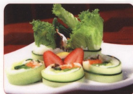
Vegetable Maki - $7.95 lettuce, shiitake mushrooms, spinach, avocado, asparagus and onion rolled in thin slices of cucumber skin (6 pc)