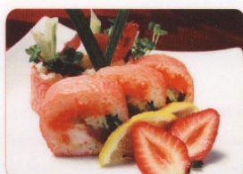
Crazy Maki - $7.95 spicy tuna, cucumber, sprouts and shrimp tempura rolled in soybean paper (8 pc)