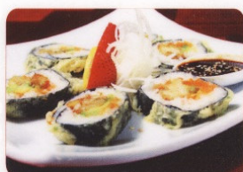
Oyster on the Half Shell - $9.95 fried oyster and avocado roll served with sweet sauce (6 pc)