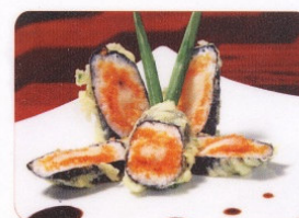
Shoi Maki - $8.95 yellowtail masago tempura roll topped with sweet sauce (6 pc)