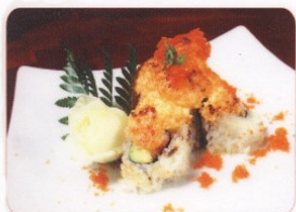
Mount Fuji - $8.95 smoked salmon and avocado roll topped with a tangy cream sauce then baked until golden brown (8 pc)