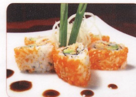
Alaska Maki - $8.95 crab and avocado with masago rolled inside out and sprinkled with sesame seeds (6 pc)