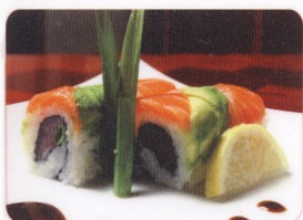
Grizzlies Maki - $9.50 spicy tuna roll topped with fresh salmon and avocado (8 pc)