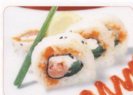
Tiger Eye Maki - $8.95 smoked salmon, cream cheese, jalapeno tempura fried, then rolled with goma soybean paper (8 pc)